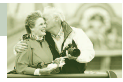
Live your dream.

as, the land must be in Canada and used in farming by you (the